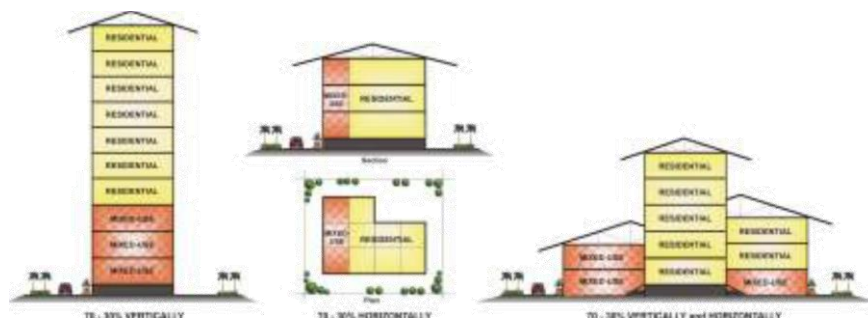
Figure 01: 70 - 30 Sharing of Uses

SECTION 14. BUILDING HEIGHT REGULATIONS. Unless otherwise stipulated in this ordinance, building heights, must conform to height restrictions and requirements of the Civil Aviation Authority of the Philippines (CAAP), the National Building Code, Structural Code, Boracay Building Construction ordinances and other ordinances of the municipality and regulations related to land development and building construction.